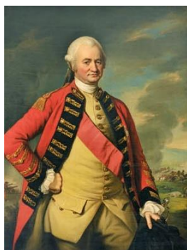
Robert Clive and The East India Company

Causality: the relationship between cause and effect